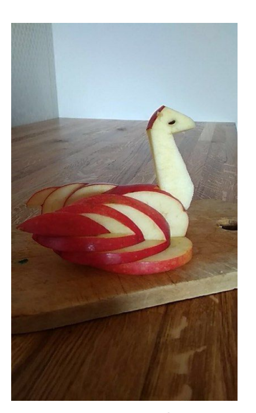
self made catcher

Cooking was for me much better then just preparing a dish and eating it, for me it was more like a art. The fact that you can make something out of nothing is for me fascinating.